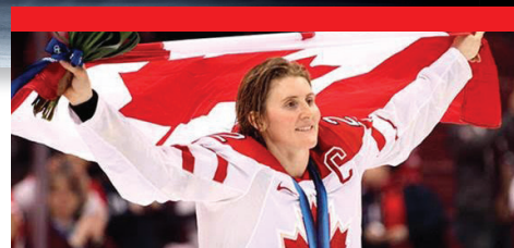
Hayley Wickenheiser celebrates after defeating the USA during the women’s final ice hockey game at the Vancouver 2010 Olympics in Vancouver.