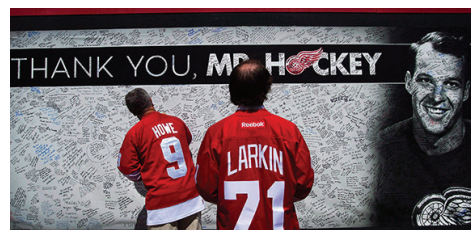
A man signs a memorial wall as thousands of people line up to pay their respects to NHL hall-of-famer Gordie Howe as the casket rests in the Joe Louis Arena in Detroit, Mich., on Tuesday, June 14, 2016.